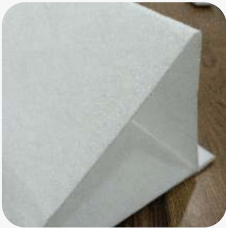
Needle Punch & Thermal Bonded