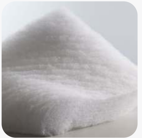
Hi-loft Thermal Bonded Wadding