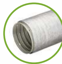
Perforated pipe wrapping