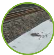
Railway track bed stabilization