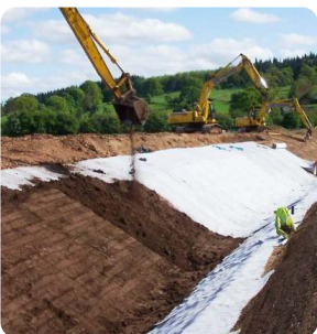
Flood mitigation channels and protection works