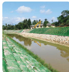
Navigational canals and waterways