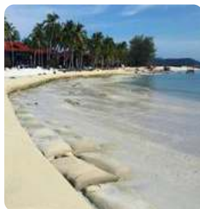
Protection of the sea-bed around jetties